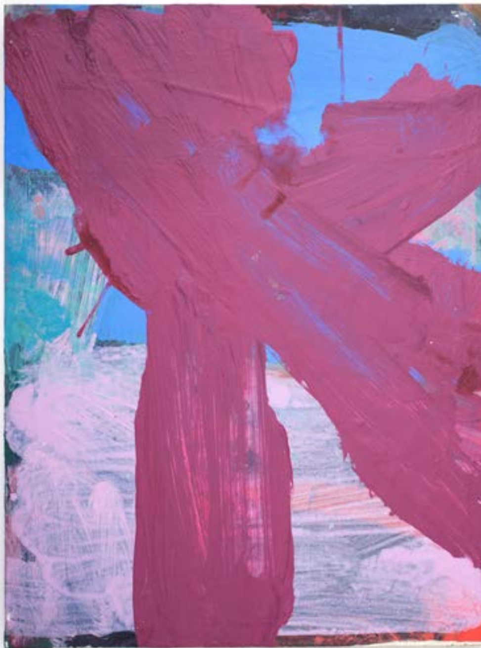
Zara June Williams Hold Fast , 2019 Acrylic on board 39.8 x 29.8 cm 15 21/32 x 11 23/32 inches