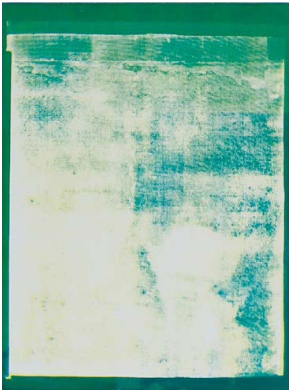
Olga Bennett Untitled vi , 2019 acrylic and silk screen ink on board 24 x 18 cm 9 7/16 x 7 3/32 inches