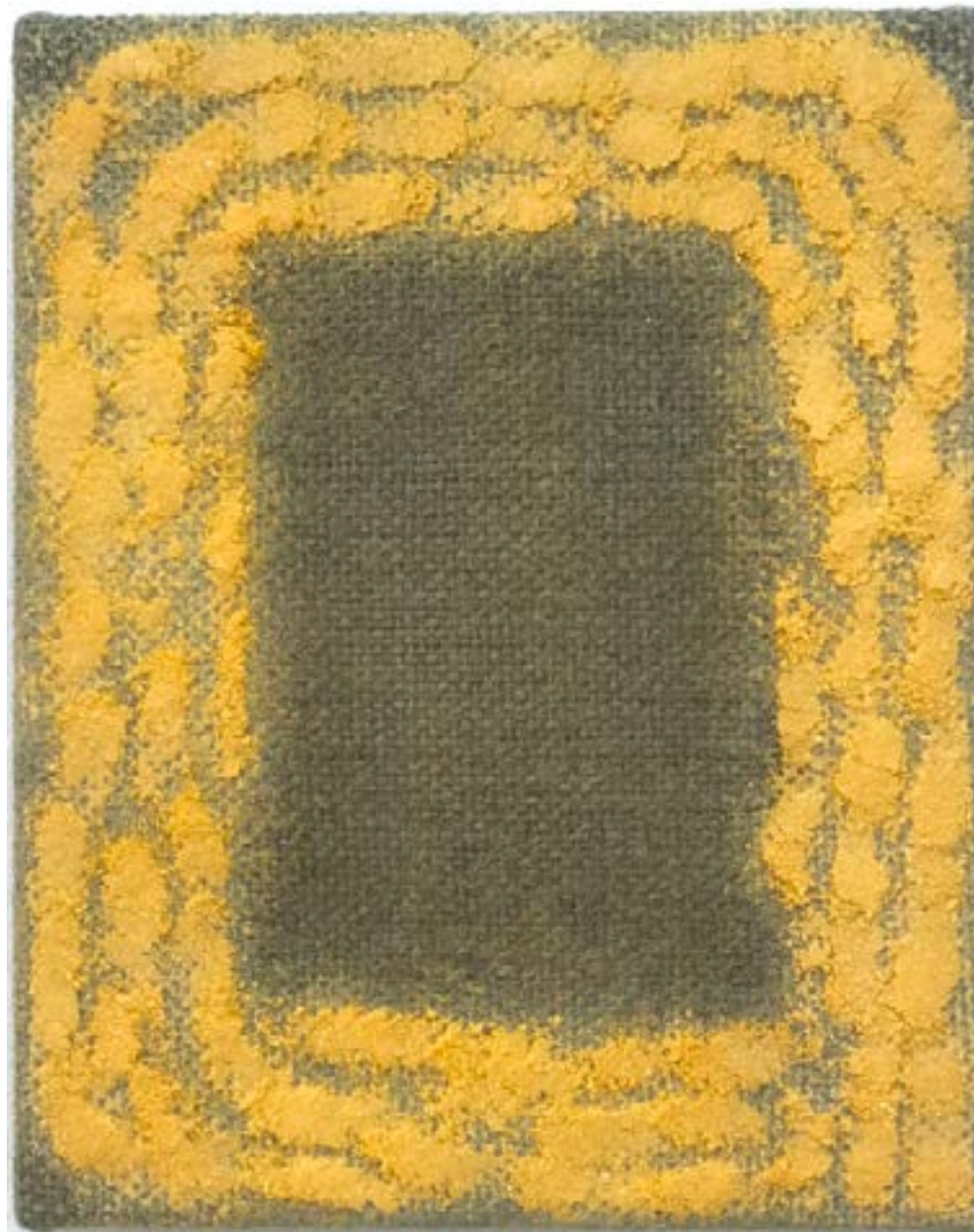
JD Reforma Whitewash 5, 2019 skin-whitening soap on linen 26 x 20 cm 10 7/32 x 7 7/8 inches