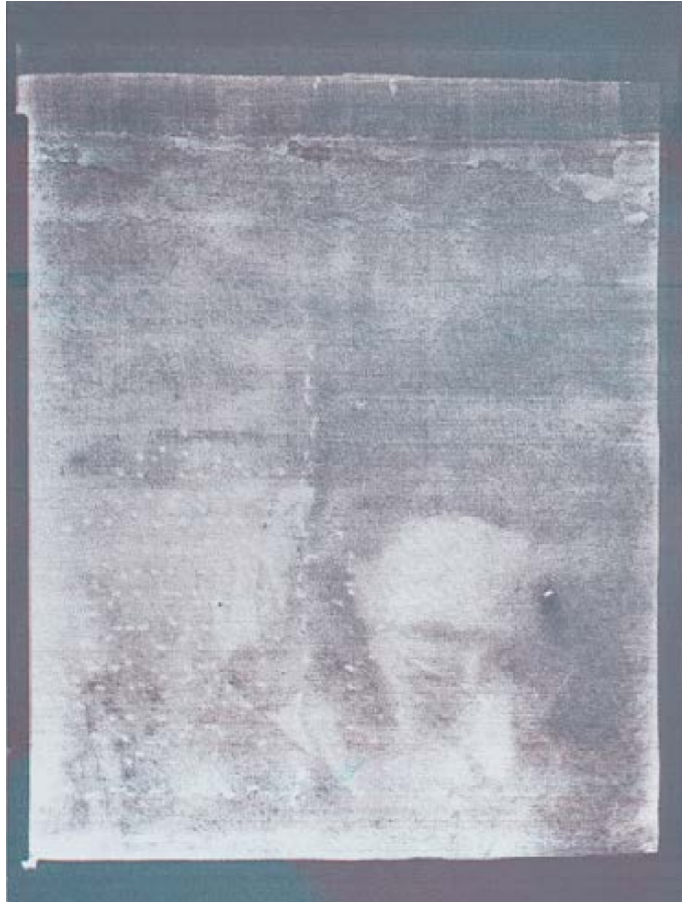
Olga Bennett Untitled v , 2019 acrylic and silk screen ink on board 30.5 x 23 cm 12 x 9 1/16 inches