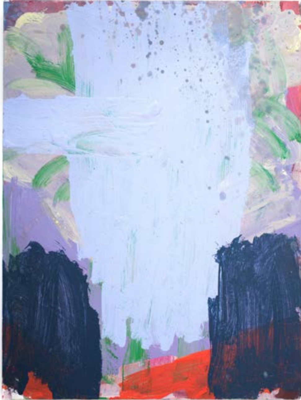
Zara June Williams Forget-Me-Not , 2019 Acrylic on board 39.8 x 29.8 cm 15 21/32 x 11 23/32 inches