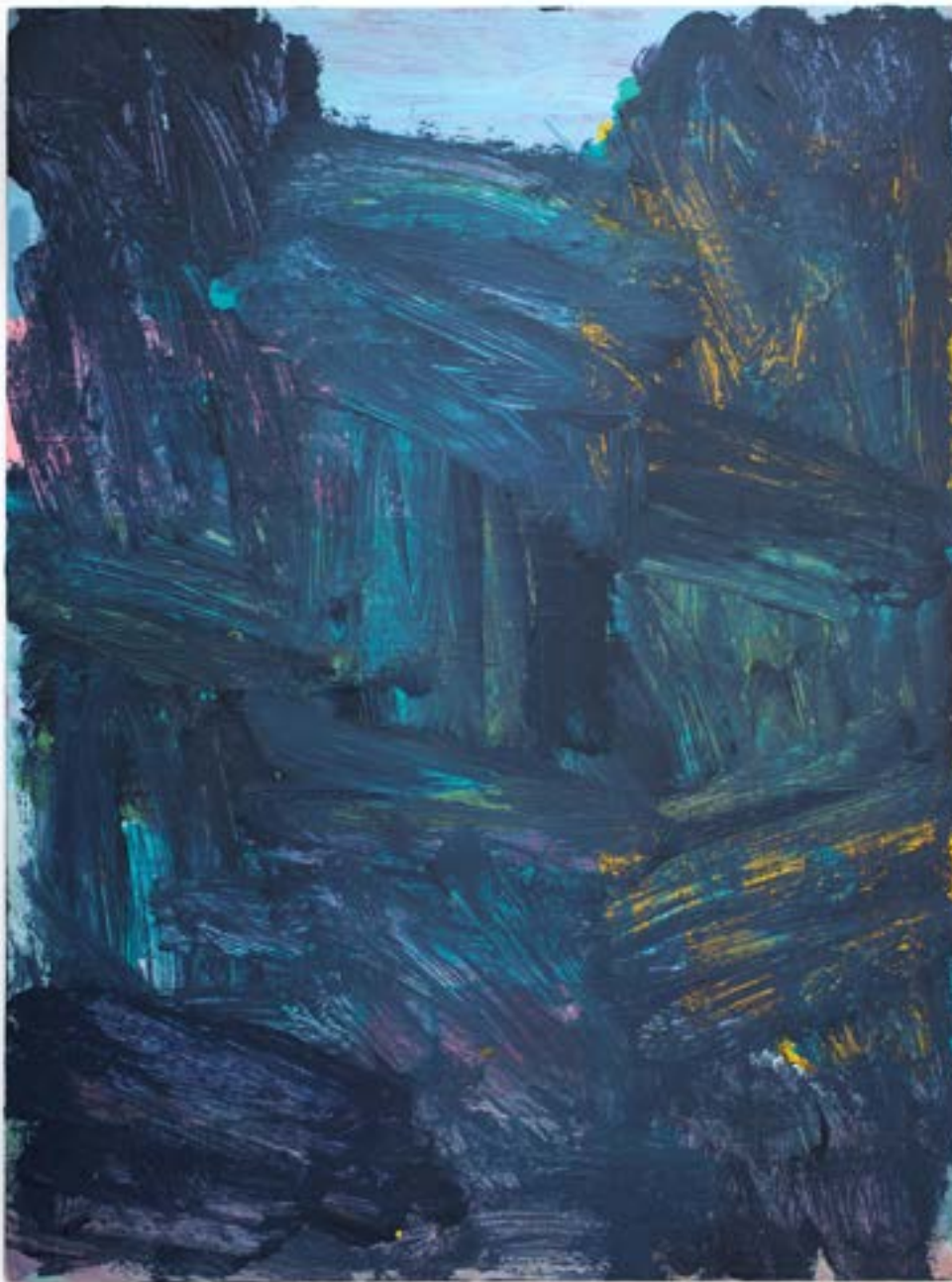
Zara June Williams Air Pocket , 2019 Acrylic on board 39.8 x 29.8 cm 15 21/32 x 11 23/32 inches