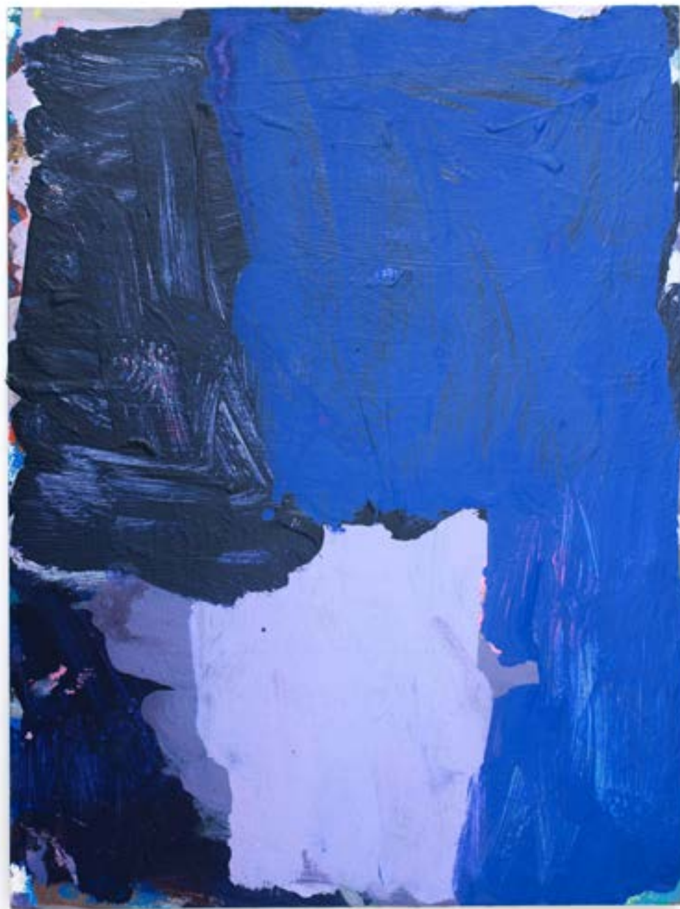
Zara June Williams Intimation , 2019 Acrylic on board 39.8 x 29.8 cm 15 21/32 x 11 23/32 inches